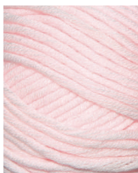
9 sea shell