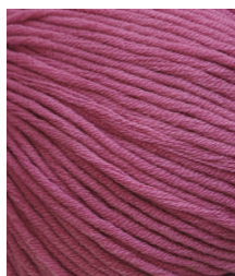
31 misty rose