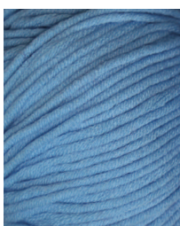
12 sky blue