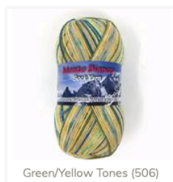
Green/Yellow Tones (506)