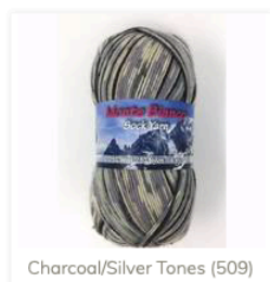
Charcoal/Silver Tones (509)