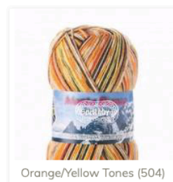
Orange/Yellow Tones (504)