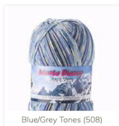
Blue/Grey Tones (508)