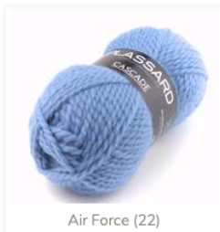
Air Force (22)