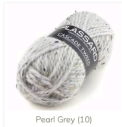
Pearl Grey (10)