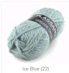
Ice Blue (22)