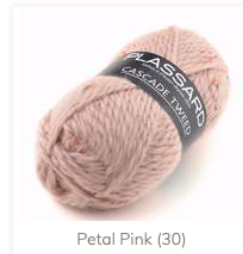
Petal Pink (30)