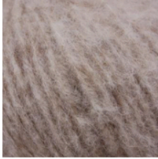
Loren col: 1315 Twig