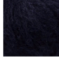
Loren col: 2341 Navy Navy