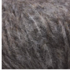
Loren col: 1360 Smokey