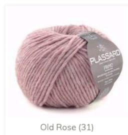
Old Rose (31)